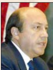
Igor Ivanov , Foreign Minister of the Russian Federation (1998-2004)