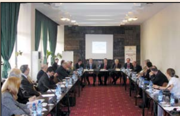
Bulgarian-Russian Round Table „Bulgarian-Russian dialogue in the context of the European idea“, Sofia

The Diplomatic Institute organises and participates in the organisation of a number of forums, conferences and round tables :