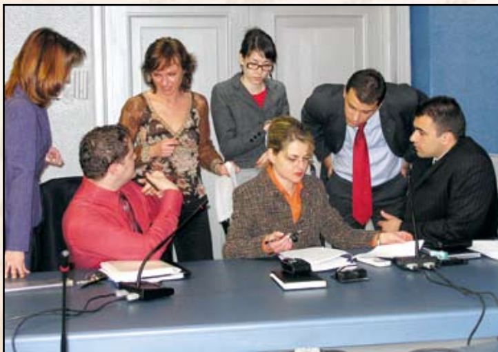
Debate in the Basic course

The duration of this course, specifically tailored to the training needs of MFA diplomats, is one year with the structure of training involving several short-term thematic modules. The objective is to offer diplomats an opportunity to participate in a series of modules focusing on topical issues in the foreign policy domain. Over the annual training period, one to three short-term training workshops are held, highlighting and examining issues related to the foreign policy priorities of Bulgaria as well as issues in the domain of research conducted by the Institute: