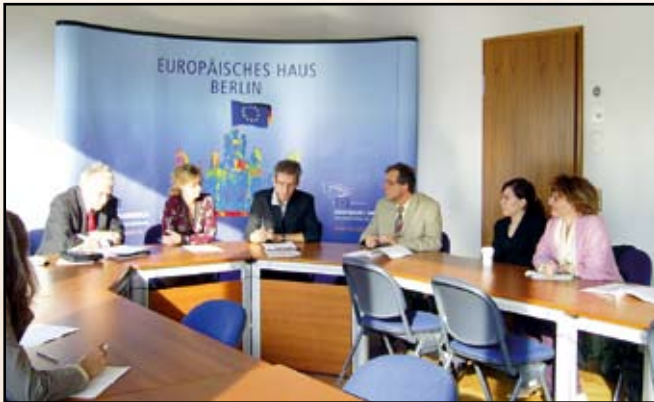
Training of civil servants in Germany