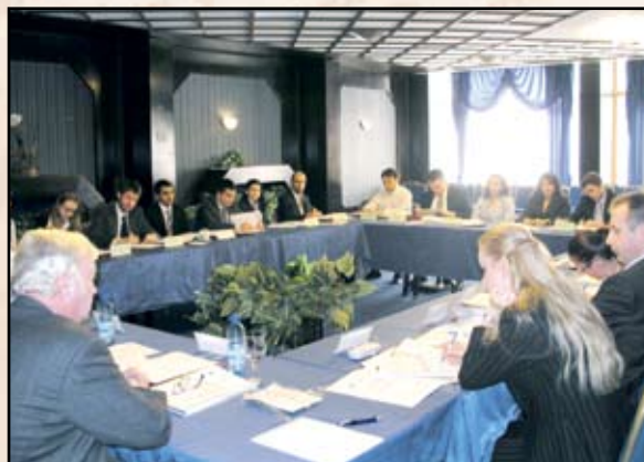
Winter School of Diplomacy, Sandanski