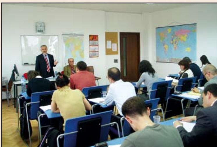
Lecture of Mr. Lubomir Kutchukov, Deputy Foreign Minister in the Basic course

As the Main Diplomatic Course is open to members of the specialist administration of MFA only, this training course meet the training needs of the members of the general administration of MFA. Its primary objective is to enhance the general awareness of administrative staff on topical foreign policy issues, improve their correspondence and protocol skills, etc.