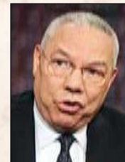
Colin Powell , Secretary of State of the USA (2001-2005)