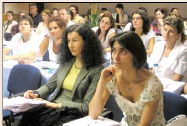
Training for successfully applying for work in the European administration

In 2008 a new joint training initiative of the Diplomatic Institute and CEFEC open to Bulgarian citizens was launched - preparation for application under EU funding programmes and lobbying techniques.