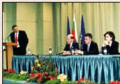
Official opening of the Diplomatic Institute activity with a public lecture of the Prime Minister of the Republic of Bulgaria, Simeon Saxe Coburg-Gotha on the subject „The Mission of the Bulgarian Diplomacy in the 21st Century“ before the Bulgarian and foreign diplomatic corps