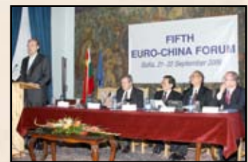
Cooperation with Academia Sinica Europaea and China European International Business School (CEIBS) - Shanghai