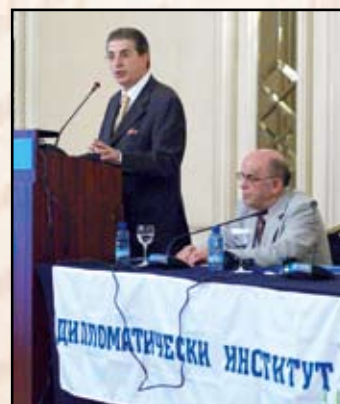
Public lecture of Mr Srdjan Kerim, President of the 62nd session of UN General Assembly

tifical Ecclesiastical Academy of the Holy See Kolinda Grabar-Kitarovic , Minister of Foreign Affairs and European Integration of the Republic of Croatia 2006