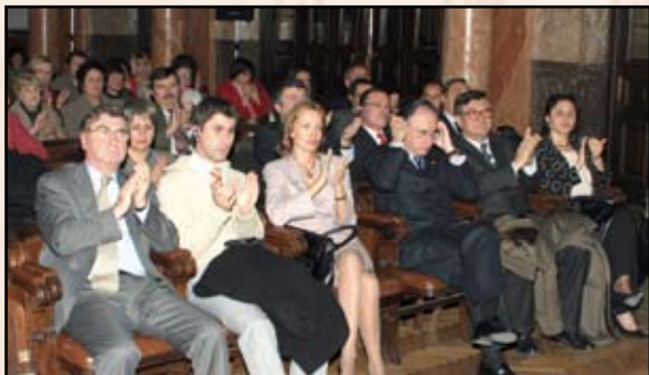
Public lecture of the BDI at the Sofia University „St. Kliment Ohridski“

The Diplomatic Institute has adopted a diverse public policy and organises diverse events aiming to promote its initiatives and reinforce its contribution to raising