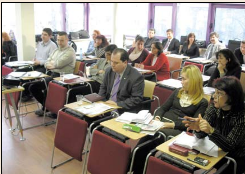
Course of Consular Diplomacy

This module is a standing, mandatory component of the improving knowledge and skills training policy of the Institute and is organized twice a year - in the spring and autumn. The course addresses the training needs of public administration employees whose work bears on various aspects of consular affairs. During the course, trainees become familiar with basic international and national legal documents - the Vienna Conventions on Consular Affairs, the Schengen Acquis, The Foreign Nationals in Bulgaria Act, and the comprehensive body of visa practice, refugee and migrant issues, public document legal-