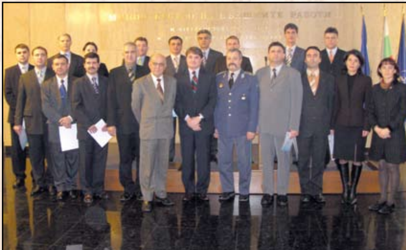
Course of Defense Diplomacy

The course is organized jointly with G. S. Rakovsky Defence College as a full-time one-month training initiative, held twice a year (in the spring and autumn). Building on experience accumulated to date, the Institute pursues the objective of making the course a mandatory element of the training of Bulgarian military attaches prior to the commencement of diplomatic mandates overseas. A number of international partner organisations of the Diplomatic Institute and the Defence College have expressed interest in the training programme, which has necessitated a requirement to design and deliver the course in English in the future.