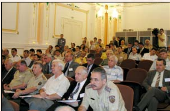
International conference „Security and defence policy: International and regional organizations and the new challenges for international security“, Rakovsky Defence College - Sofia

of NATO?, a collection of the 14 best essays has been published in English