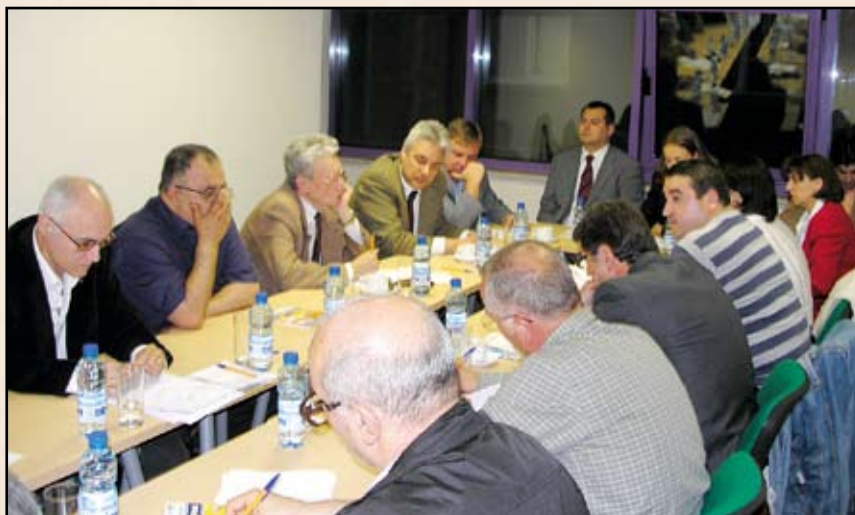
Think-tank at the Diplomatic Institute

The intensive partner network contacts established with organisations from the Netherlands, France, Switzerland, Germany, UK, Greece, Turkey and Romania have been enhanced and expanded by new forms of cooperation with similar institutes from Russia, Serbia, Montenegro, Croatia, Israel, Uzbekistan, Azerbaijan, etc.