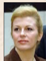
Kolinda Grabar-Kitarovic , Minister of Foreign Affairs and European Affairs of the Republic of Croatia (2005- 2008)