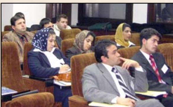
Course for Afghan diplomats