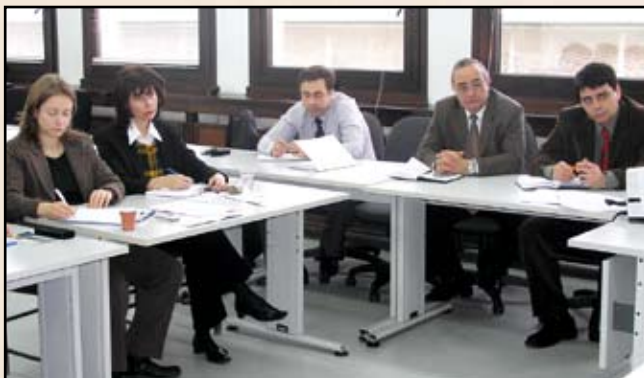
Foreign language training

Over the course of the annual training programme special language skills are taught, designed to develop communication skills and enhance knowledge of special terminology in the area of European integration etc. Depending on expressed interest, the Diplomatic Institute offers training programmes in other languages - Greek, Portuguese, Czech, Polish, Romanian, Slovakian, Slovenian, Serbian, Croatian etc.