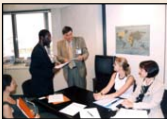
Agreement for cooperation with the Intergovernmental Agency of the Francophony-Paris