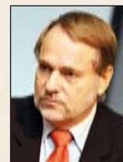
Jan Petersen , Chairman of the Parliamentary Commission of Defense in the Parliament of Norway, Foreign Minister of the Kingdom of Norway (2001-2005)