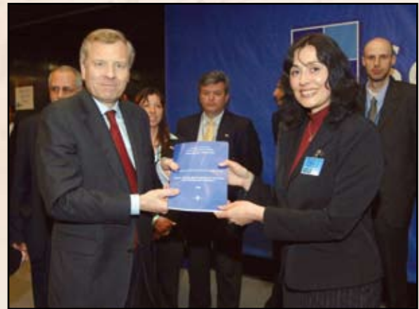
Delivering of the book of essays on NATO to the NATO Secretary General Jaap de Hoop Scheffer