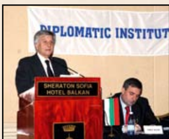
Lecture by Jean-Claude Trichet, President of the European Central Bank