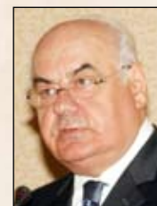
Alfred Moisiu , President of the Republic of Albania (2002 - 2007)