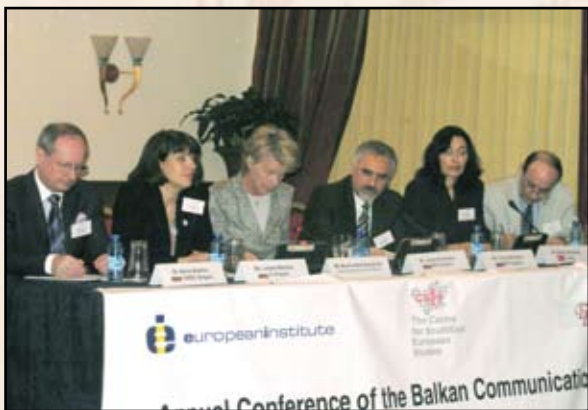
Balkan Meeting of research centers and institutes in Sofia

Research activities at the Diplomatic Institute are a function of the foreign policy interests of Bulgaria and the ally policy it pursues as a NATO and EU Member State.