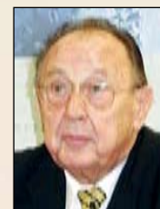
Hans-Dietrich Genscher , Foreign Affairs Minister of Federal Republic of Germany (1974-1982)