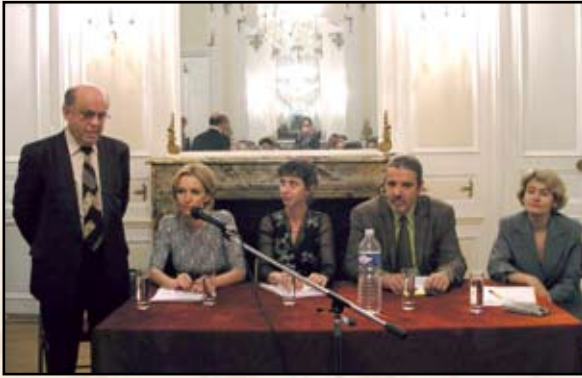
Franco - Bulgarian Symposium „The challenges of the membership: what will be the place of Bulgaria in Europe“, Paris

lands Institute of International Relations, Clingendael Dr. Srgjan Kerim , President of the 62 nd session of the United Nations General Assembly Academic Evgeni Primakov , Prime Minister (1998-1999) and Minister of Foreign Affairs of the Russian Federation (1996-1998) Paavo Lipponen , Prime Minister of Finland (1995-2003); Speaker of the Finnish Parliament (2003-2007) 2008