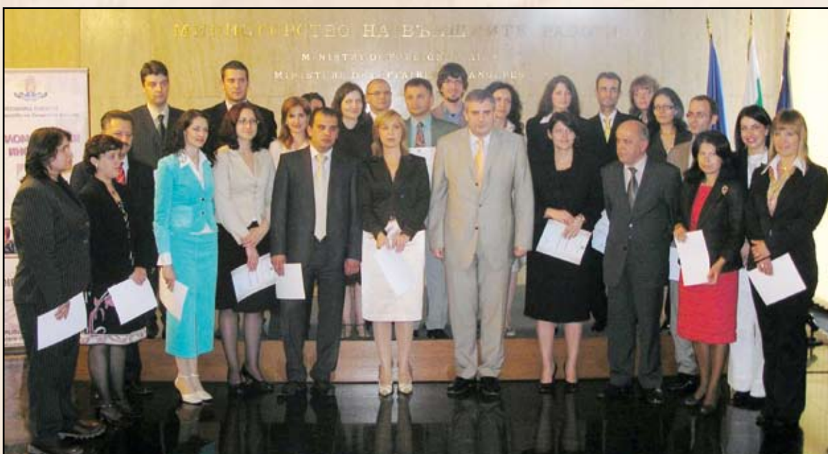
Graduation of the Sixth Basic Diplomatic Course

The objective of the course is to augment the knowledge of participants and provide them tools to develop necessary practical skills of immediate relevance to their operational diplomatic practice. The training course is structured in lectures and interactive exercises.