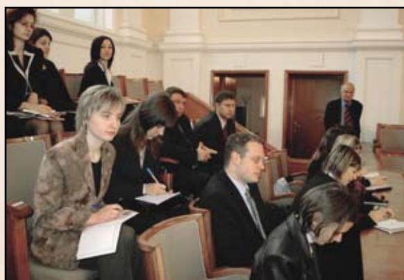
Junior MFA course participants visiting the Parliament