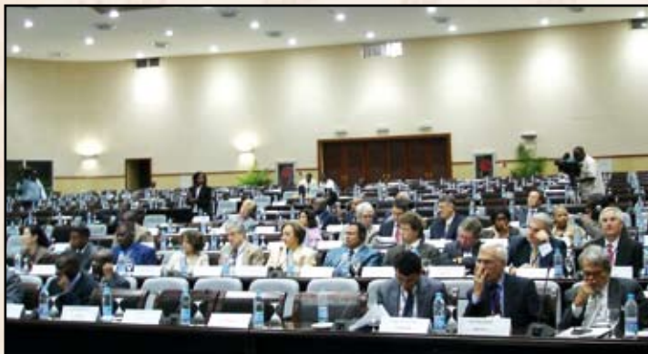
Annual world meeting of the directors of the Diplomatic Institutes

The planning and organisation of training and research activities at the Diplomatic Institute is inextricably linked with the development of a wide partner contact point network.